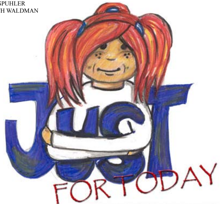
ILLUSTRATION BY KIM SPUHLER CREATED BY DAVID KENNETH WALDMAN

“I want to make a deal. Just for today, allowing me to indulge in all I want is a virtue”